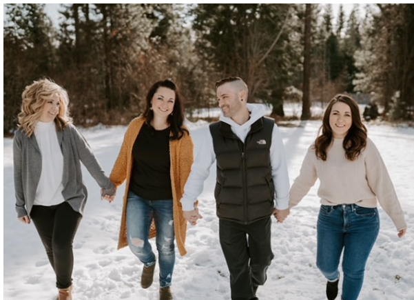
The 4 “K’s”