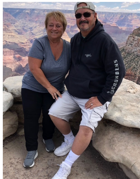
The Wheelers - Now