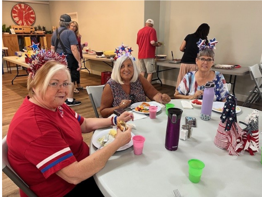
Loving me some 4 th of July hats!!!!!!!