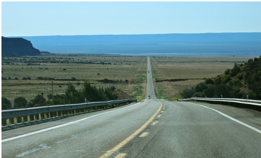
Sometimes you can drive and drive and never see civilization. This photo was taken on State Route 389 near the town of Colorado City.