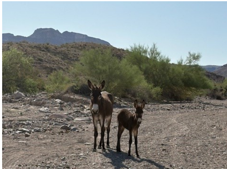
So many babies this year.

So, until fall and all my buddies (including me) get uncovered, may you have sweet dreams of our Side-by-Side adventures coming soon. Remember, always be safe and drink plenty of water. See you in September!!!!!!