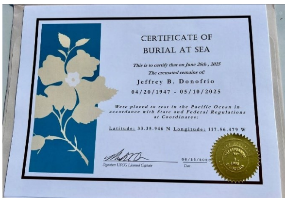
Certificate of Burial at Sea