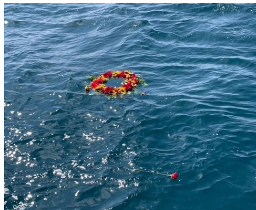
Wreath and Rose