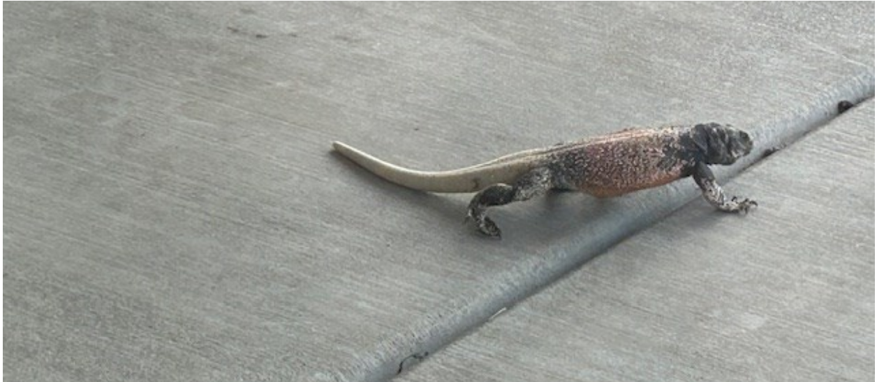
Mr. Chuckwalla needs a home