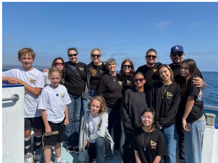
family and my support