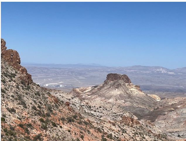
View at Hudson's Heaven

While taking in the view, we all notice a strange outcrop. Unable or unwilling to try to get to the outcrop we tried to take pictures and zoom in. Still not sure what it is, we all let our imaginations take over and decided it was a foot of a dinosaur..... What do you think? And who could prove us wrong as it is impossible to get any closer.....Thanks Cactus Pete for the great zoom job.