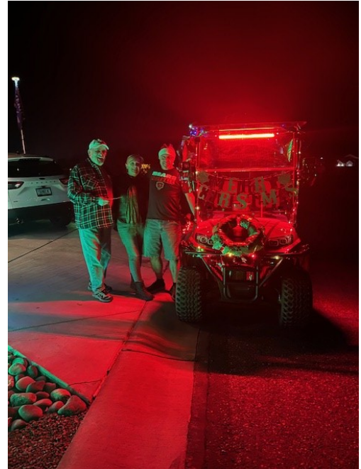
1 st Place-Dehart's