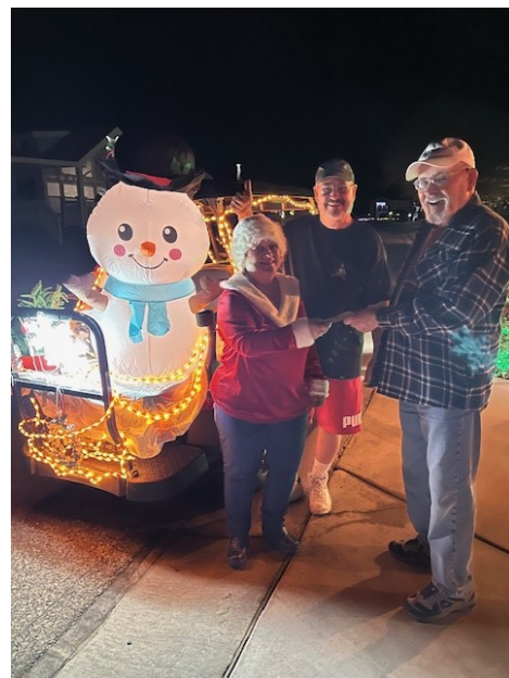
3 rd Place - Wheeler's