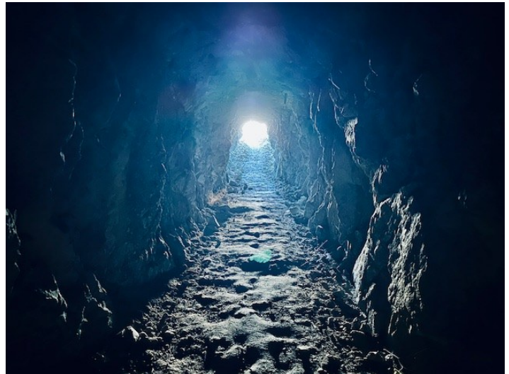
A trip to Tyro mine