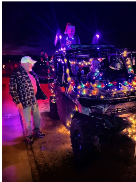
2 nd Place - Smith's