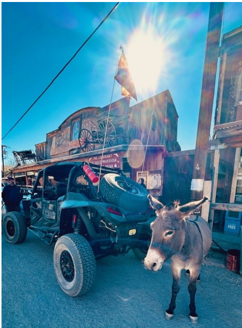
The perfect Datman pic