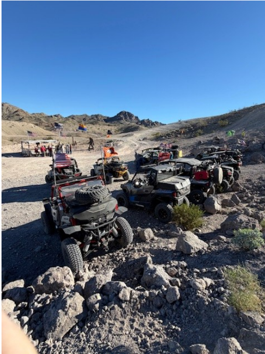
A couple of our stops - Just look at that blue sky!